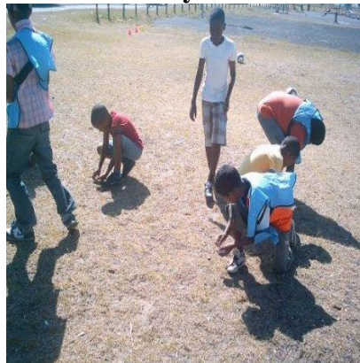
Boys in action and very proud

By changing the atmosphere we believe we need to start changing our environment in our community. We encouraged our boys to clean our practice field before they start to practice. It is a small step towards our bigger picture a Clean & Safe Cape Town.