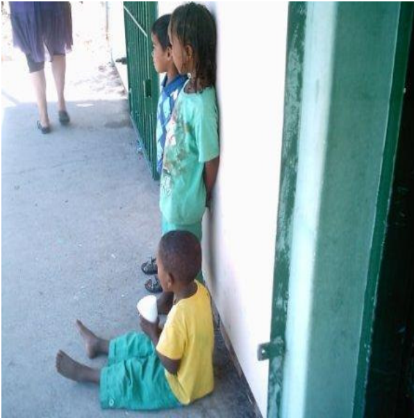
Boys having a tea break